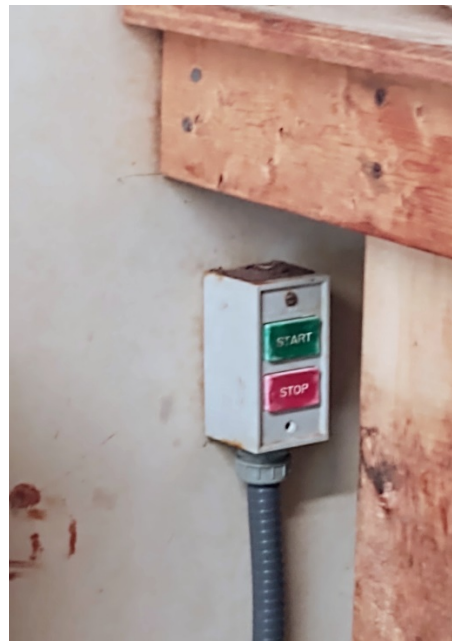
Mail Pool Filter Power Switch – Select the appropriate button as needed.