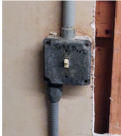
Baby Pool Filter Power Switch – Shown in On Position

If it becomes necessary to shut of the power to the Pool Filter Pumps, the switches pictured below are the power source switches for the individual pumps as listed. If not accessible select the Main (4 Top Breakers) in the breaker panel on the back wall when entering the space.