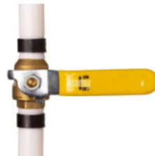
Handle perpendicular to pipe Closed