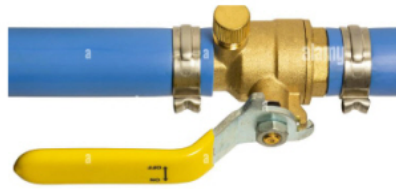
Handle in Line with Pipe Open